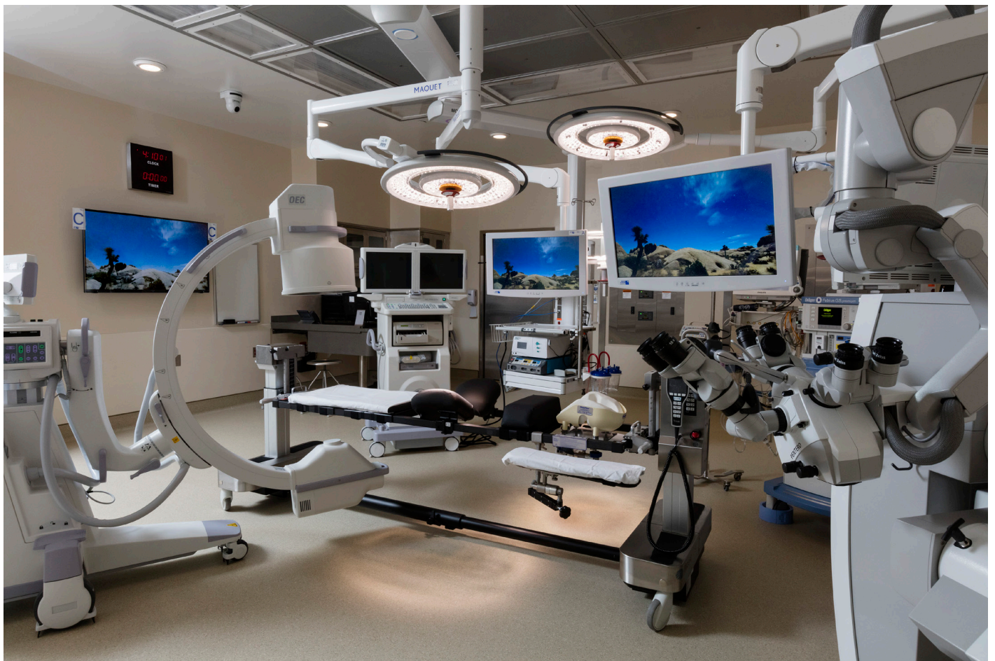
Enabling video collaboration across all integrated rooms

With EasySuite® 4K, clinicians can record HD video from one or two HD and UHD sources simultaneously to capture the entire procedure, or shorter segments of it, and save it in industry-standard MPEG-4 video format.