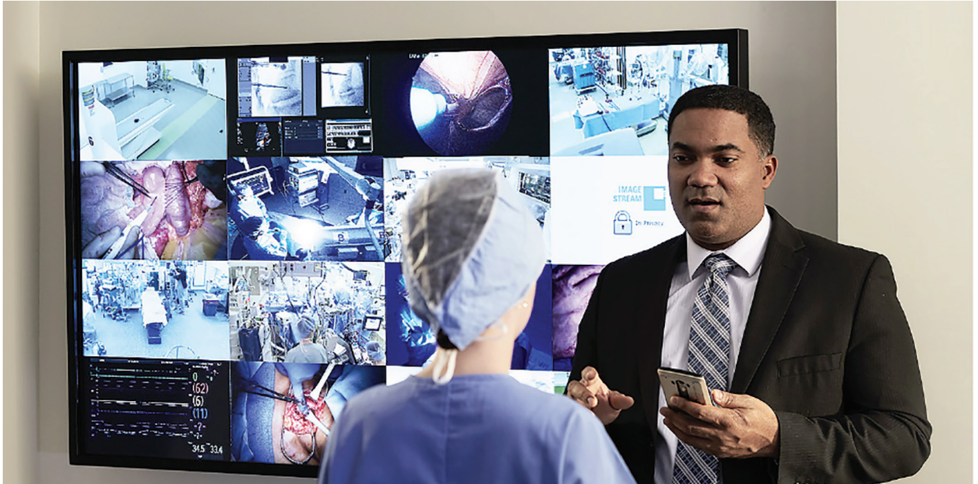
“LiveStream® StatusBoard:” See surgery room status in real time and optimize room utilization