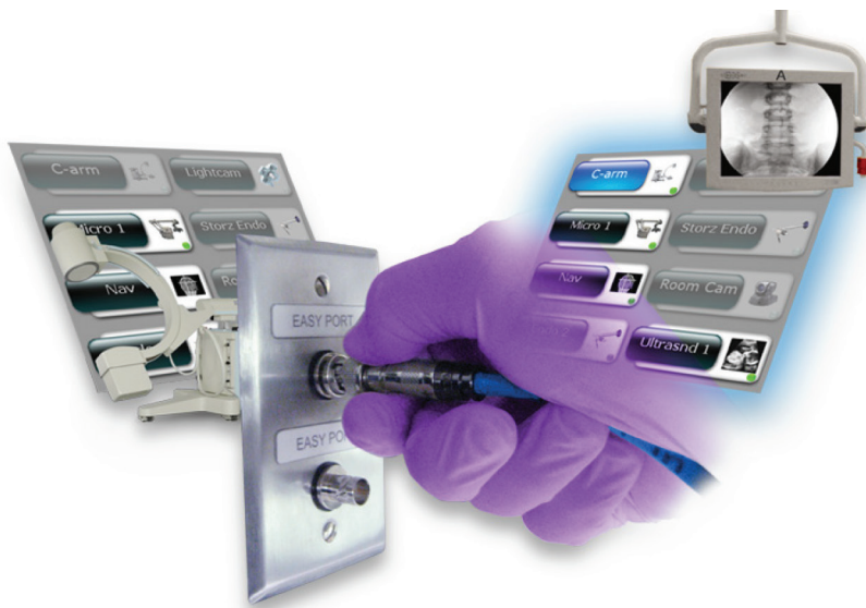
“EasyPort®:” One-handed device connection speeds room setup

Studies demonstrate that pre-surgical positive distraction can reduce patient anxiety and pain. The Patented 4K Patient Greeting System's library of soothing music and videos helps establish a calm environment for adult and pediatric patients. Once the procedure begins, clinicians can stream music from personal devices or run popular music streaming services through EasySuite® 4K's high-quality audio control system to maintain a relaxed work environment.